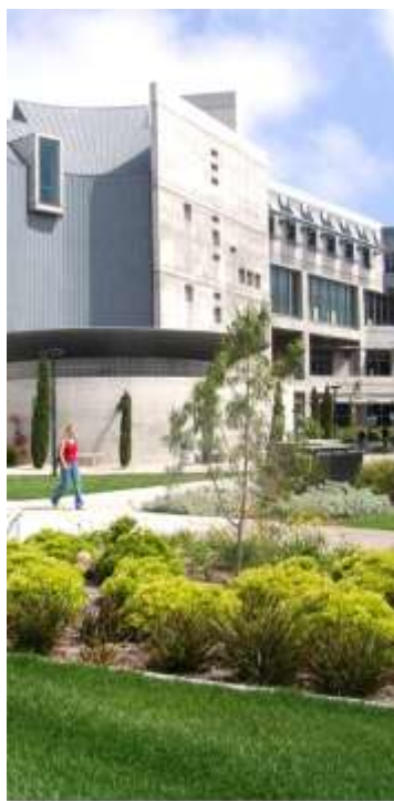
SAN DIEGO MESA COLLEGE