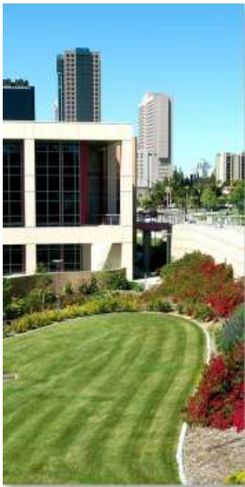
SAN DIEGO CITY COLLEGE