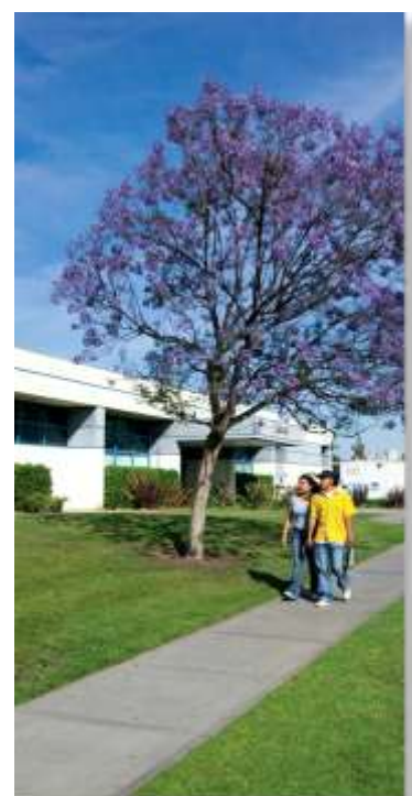
SAN DIEGO MIRAMAR COLLEGE